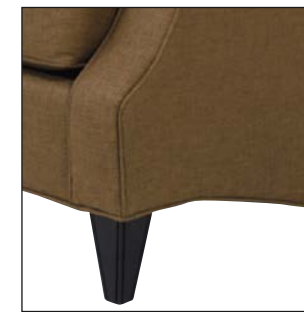
1914 Campbell Sectional Tapered Leg