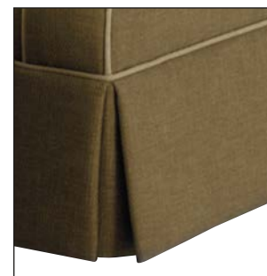
1488 Reynolds Sectional Empire Skirt

All sectional pieces are available for each configuration in the series 1488 and 1914.