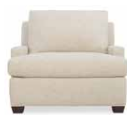
CHAIR AND A HALF