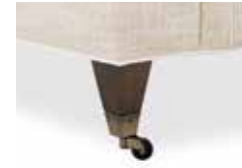
POST WITH CASTER