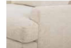
TRACK ARM WITH "T" CUSHION