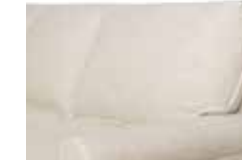
KNIFE EDGE BACK