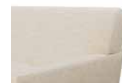
MODERN TIGHT BACK