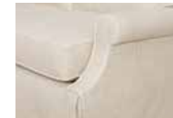
RECESSED SOCK ARM