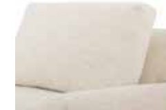
STRAIGHT BORDERED BACK