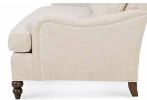
DEEP DEPTH 42"