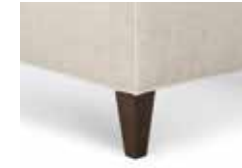
POST NO CASTER