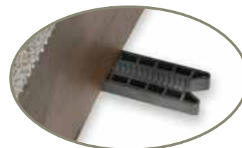
Quick Secure Connection