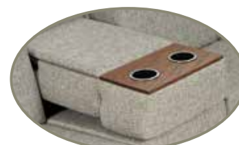
Fold Down Cup Holder Console Makes Sofa 8" Narrower