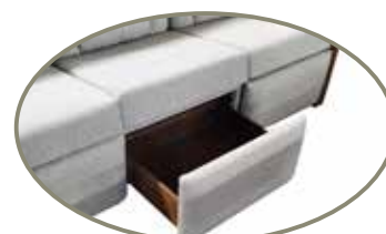
Sofa Center Drawer Full Ext. Under Mount Soft Close