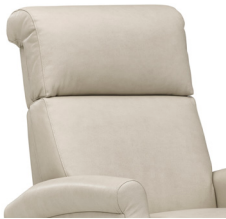
4 - ROLLED BACK