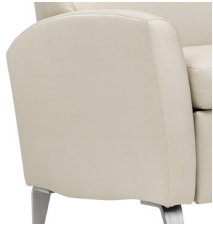
0 - FLARED ARM