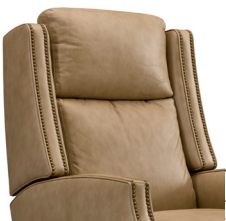
C - SEAMED PILLOW BACK W/ WING