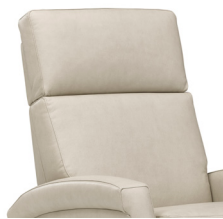
6 - SPLIT BACK