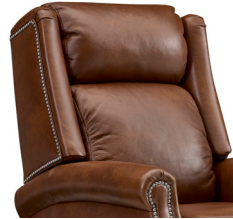
A - BUSTLE BACK