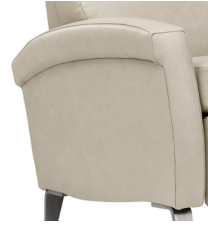
3 - KEY ARM