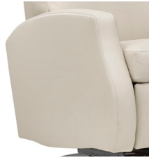
1 - TRACK ARM