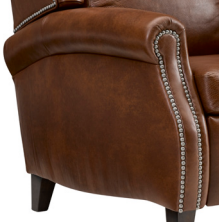
H - SWOOPED ROLLED ARM