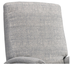
D - SEAMED PILLOW BACK*

*Back styles A and C are standard with #9 Nails along the wing (must specify finish)