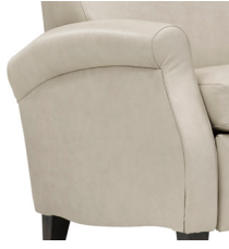
2 - ROLLED ARM