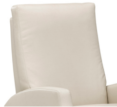
5 - SOLID BACK*