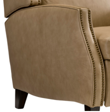
I - SLOPED TRACK ARM