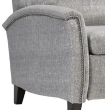
J - PADDED ARM

*Arm styles H, I, and J are standard with #9 Nails (must specify finish)