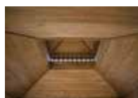
Wood Ceiling Choice of stain color, no paint.