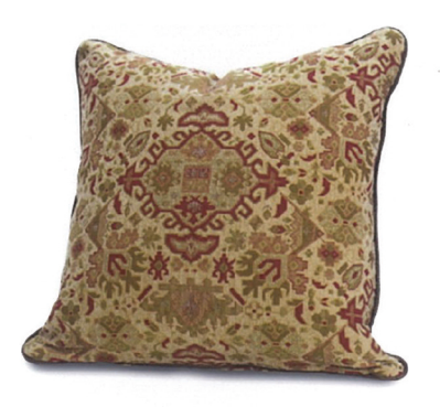
P9 | 24 x 24 in. Knife - edge with welt Covered zipper on back