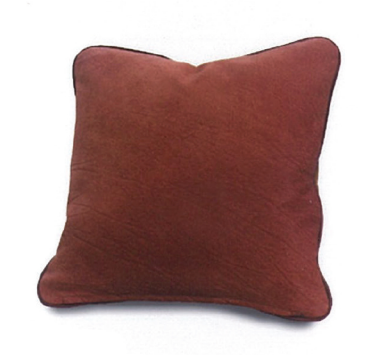
P8 | 19 x 19 in. Knife - edge with welt Covered zipper on back

P5 | 16 in. Diameter 1 1/2 in. Border with welt Center button Zipper in border