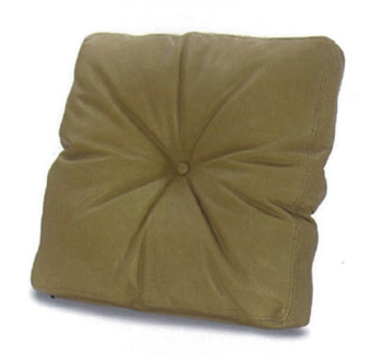
P6 | 17 x 17 in. 2 in. Border with baseball stitch Center button Zipper on bottom

P3 | 19 x 19 in. Knife - edge with welt Diamond insert (2 buttons) Solid panel on back Zipper on bottom