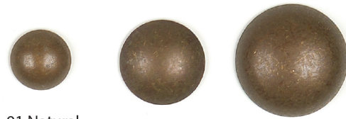
01 Natural 09 Small 3/8 in. round 54 Medium 5/8 in. round 52 Large 3/4 in. high dome round