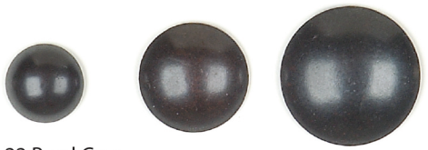
22 Pearl Grey 09 Small 3/8 in. round 54 Medium 5/8 in. round 37 Large 3/4 in. low dome round