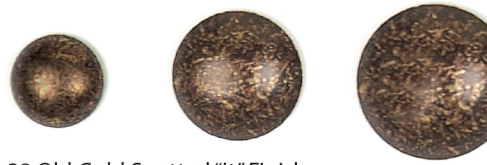
38 Old Gold Spotted "It" Finish 09 Small 3/8 in. round 54 Medium 5/8 in. round 52 Large 3/4 in. low dome round