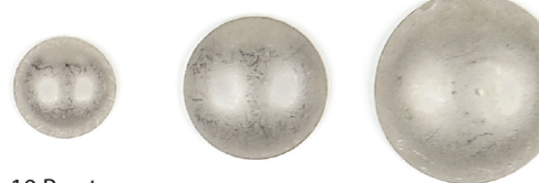
10 Pewter 09 Small 3/8 in. round 54 Medium 5/8 in. round 52 Large 3/4 in. high dome round