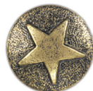
1053 Raised Star Brass Oxford Finish

NOTE: Only available in the finishes and sizes shown. Upcharges are specified on our price list