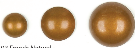
03 French Natural 09 Small 3/8 in. round 54 Medium 5/8 in. round 52 Large 3/4 in. high dome round