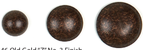
46 Old Gold "Z" No. 3 Finish 09 Small 3/8 in. round 54 Medium 5/8 in. round 52 Large 3/4 in. low dome round

NOTE: Standard Nailhead Finishes are available at no additional charge.