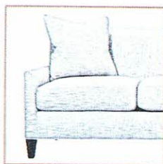
M. Envelope Arm