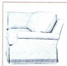
P. Pillow Back