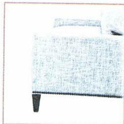
10. Post No Caster