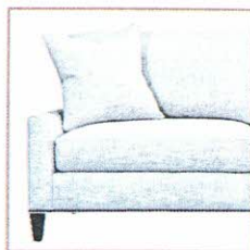
N. Bevel Arm