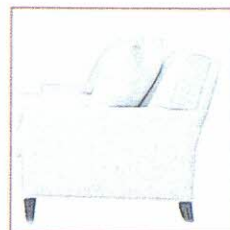
S. Bordered Tight Back