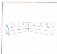
34./37. Sectional Ottoman