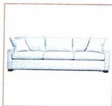
09. 108" XL Sofa