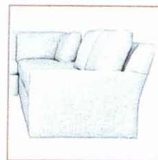
12. Upholstered Base