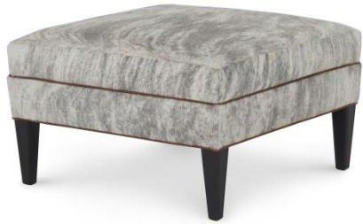
L629-32 Trey Ottoman