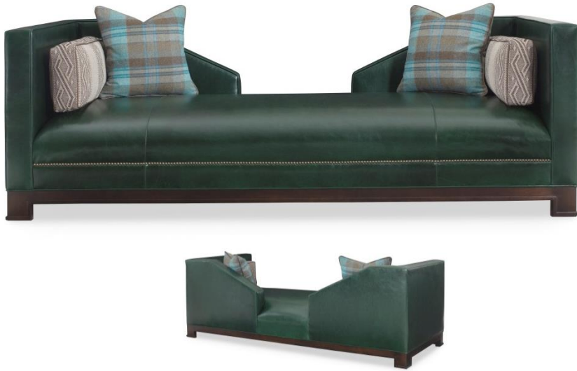
P1980-91 Social Sofa