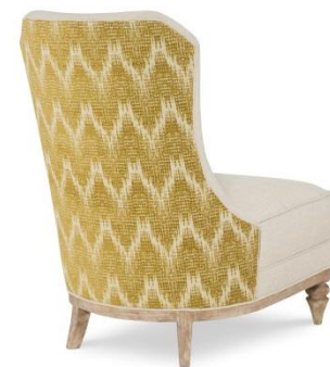
P606 Urbane Armless Chair - Back