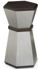
P5410 Bright Spot Hex Table