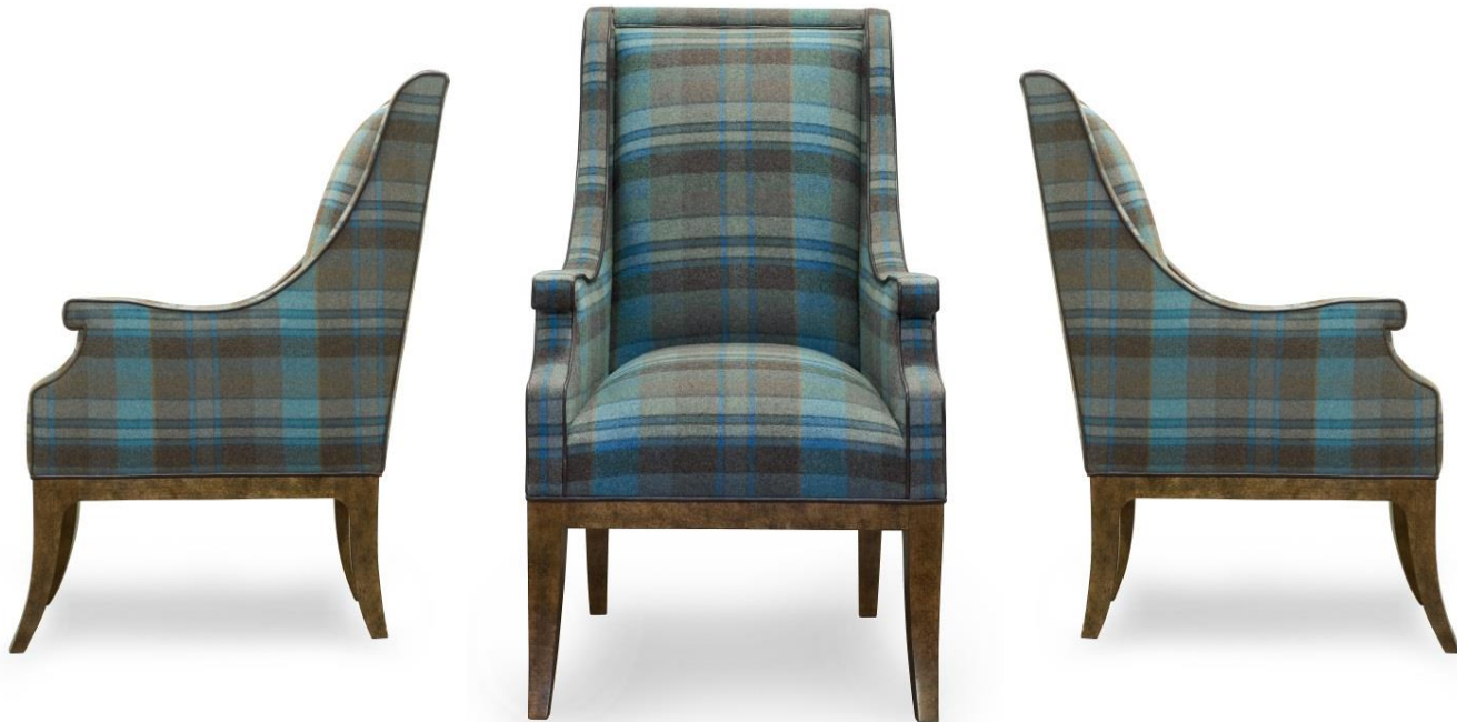
P610 Mannerly Chair