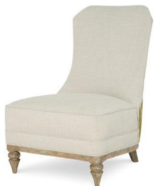
P606 Urbane Armless Chair