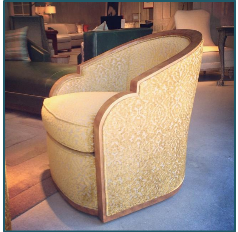
P608 Gracious Swivel Chair