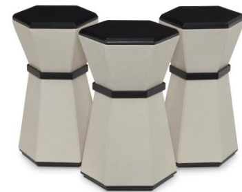
PL5411 Brilliant Hex Table