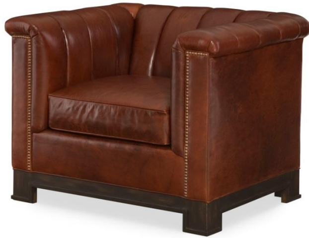
PL609 Civil Chair