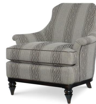
P607 Proper Chair